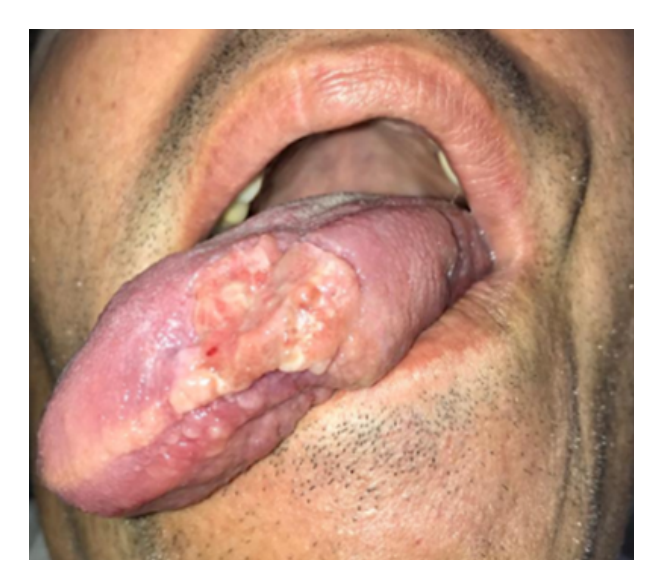
Figure 2: The aspect of the tongue after the incisional biopsy showed a modified appearance and general volume increase.