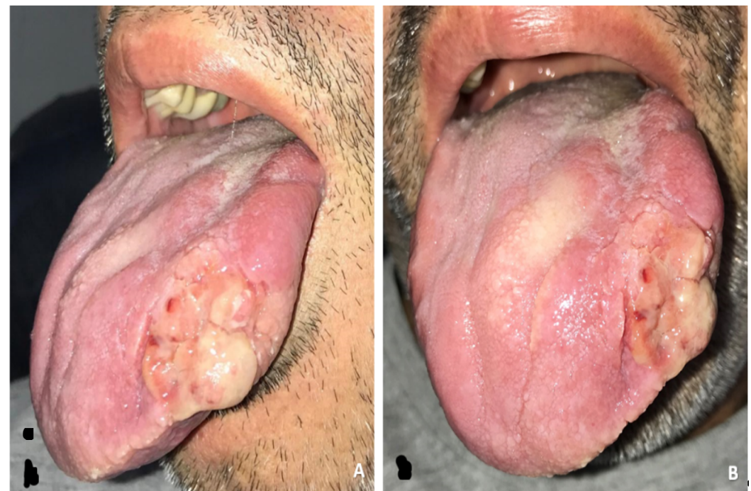
Figure 4 A and B: Appearance of the lesion with little improvement in the size of the lesion after an attempt at low-intensity laser therapy.