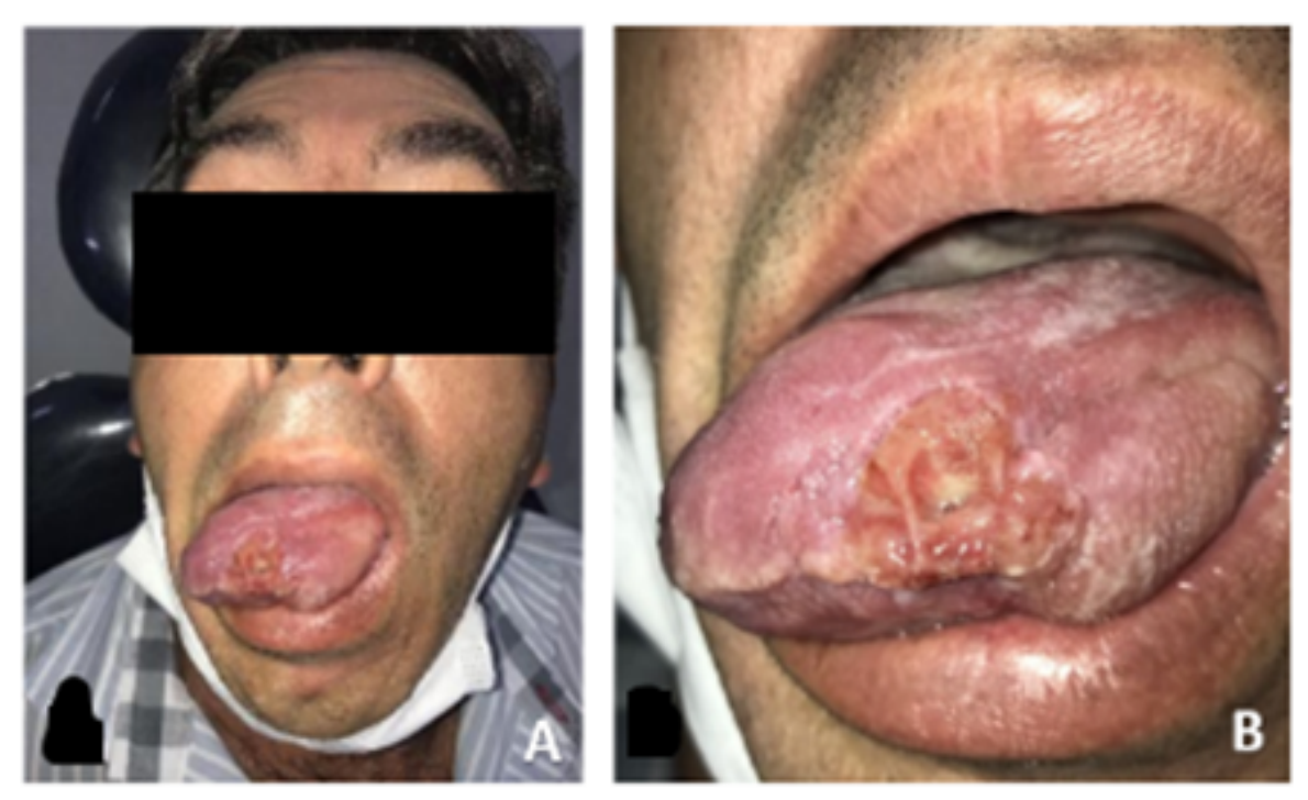
Figure 1: A- Frontal view of the patient exposing the tongue with the lesion. B- Granulomatous and ulcerated lesion approximately 2.5 cm in length on edematous tongue.

day. After discharge, the treatment was adjusted to Itraconazole, initially with 200 mg every 8 hours for three days, later changed to every 12 hours. Three years later, the patient continues to use Itraconazole prophylactically and is being monitored by the infectious disease team. Chest imaging exams did not show pulmonary involvement, and 20 days after the start of antifungal treatment, the lingual lesion showed complete remission (Figure 5).