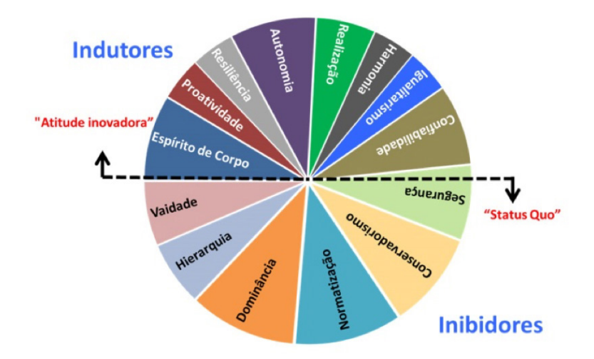
Figure 3 - Structure of Innovation Value Factors

Azevedo (2018), based on the studies of Oliveira and Tamayo (2004), drew up a list of preferences that Defense sector actors prioritize when establishing alliances. The values systematized by the author are grouped to compose fifteen "Innovation Value Factors" (FVI) of the Defense sector. According to the author's proposal, there are inducing values tending to lead agents to an innovative attitude by forming alliances. Some tend to keep the Status Quo , the so-called inhibitors. According to the author, the environment will be more conducive to innovation, depending on the amount of inducing values the agents have or share (AZEVEDO, 2018). Figure 3 presents a dashed line that subdivides the groups of factors into two parts. The values above that line induce agents to an innovative attitude, and those below tend to keep the Status Quo .