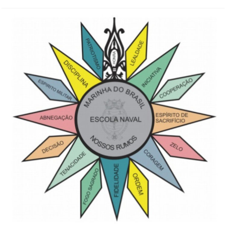
Figure 4: Rose of Virtues of the Naval School

In total, 34 (thirty-four) "Behavioral Competencies" were found in documents. It is worth pointing out that if the constant values of the "Rose of Virtues" (Figure 4) are considered, there are a total of 40 (forty) "Behavioral Competencies." It is also important to highlight that the Naval School, the institution responsible for training MB officers, has a set of values to be developed in each of its courses. The complete list of behavioral competencies can be found in Brasil (2016b).