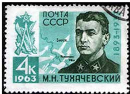
Figure 5: Marshal Tukhachevsky (1893-1937) honored on 1963 Soviet stamp

In the mid-1960s, through various theoretical studies, interest in operational art gradually resurfaced, while keeping nuclear weapons issues under review. Research on the events of World War II and themes relating to the operational use of tank cars and deep operations was once again studied under the theoretical lens of operational art. Thinkers killed during the period of Stalin's purges were valued again (Figure 5). Already in the 1970s, the Soviet understanding was that nuclear weaponry had altered the nature of war, but conventional combat would continue to take place. What happened was an even greater increase in complexity, with the addition of new electronic means and precision weapons, for example, in addition to the need for joint operations. In this new scenario, the possibilities of combat increased and, consequently, the difficulties of command and control and logistics. In this context, operational art has resurfaced. In 1970, Soviet Chief of Staff General Zakharov wrote: "The theory of deep operations has not lost its importance at present. It can underlie the creative work of commanders when solving today's complicated and complex problems" (GLANTZ, 2012).