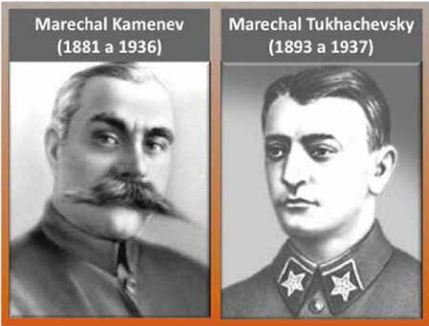
Figure 4: Marshal Kamenev and Marshal Tukhachevsky