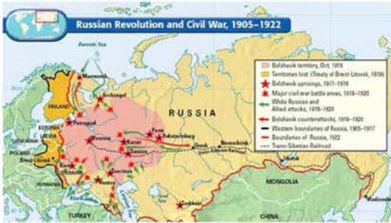
Figure 3: Space and time distribution of battles of the Russian Civil War