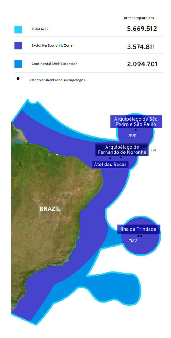
Figure 2: Brazilian Blue Amazon and Oceanic Islands