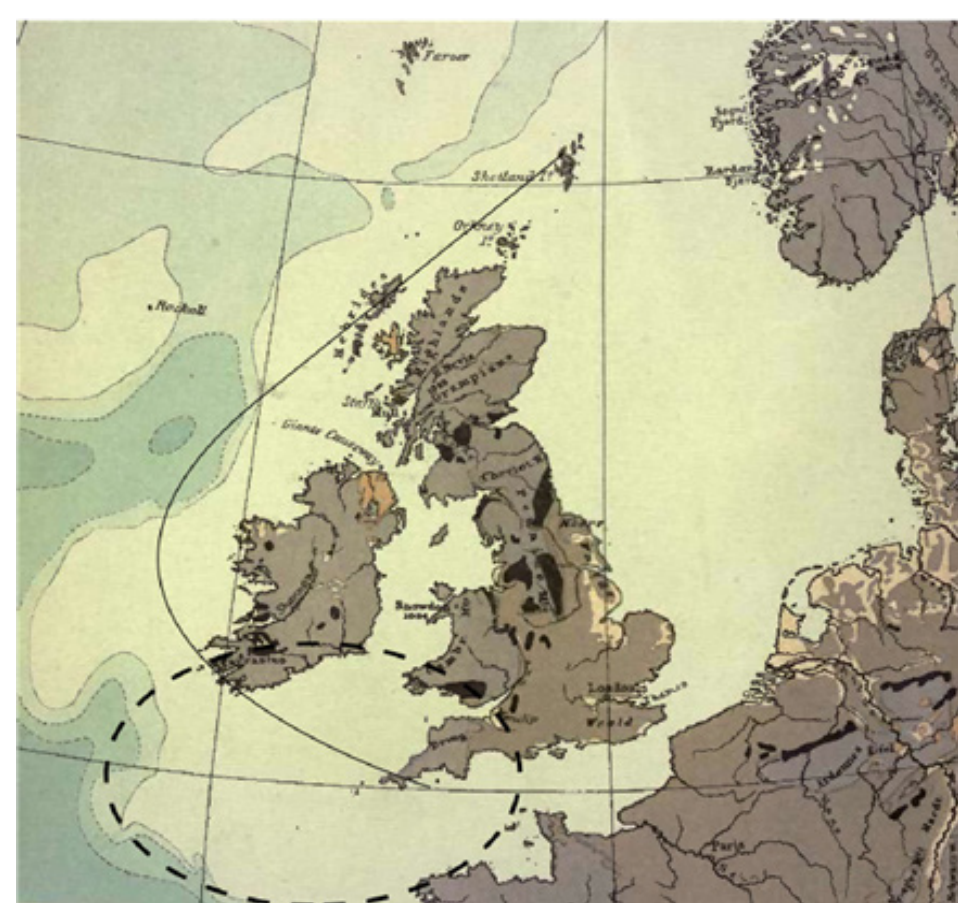
Figure 2 – The Antechamber of the Royal Navy